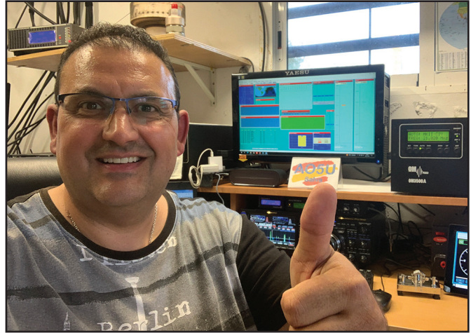
Salvador, AO5U (EA5U), Top 15-Meter Single Band High Power Score From Spain

In closing, please note that the next CQ World Wide WPX SSB and CW Contests are qualifying events for WRTC 2026. The stage is set for breathtaking performances by the best of the best, near the peak of Cycle 25, so mark your calendars now for March 30 and 31 (SSB), 2024 and May 25 and 26 2024 (CW). It should be eyewatering!