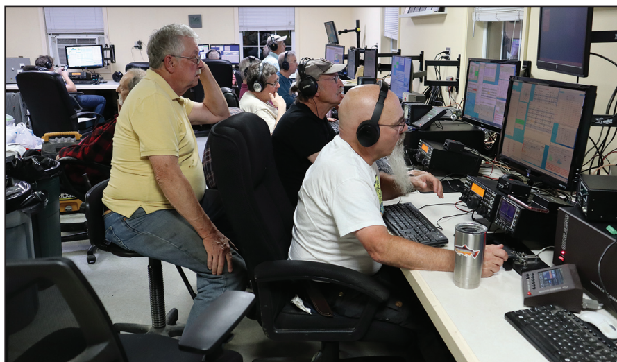
The NR4M Crew in Action on Their Way to #1 in the USA in the Multi-Multi Category

the multiplier leader among single ops at 59%, followed by OM2VL at 51%; note that OM2VL was in the High Power 20-meter Single Band category.