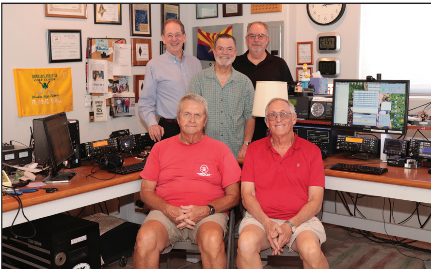
The NU7Y Multi-Single High Power Team. Front Row: W8TK, KE2VB. Back Row: K7ROG, K7AZT, NU7Y