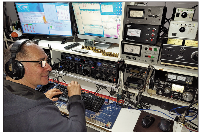
LO7H (LU1HLH) #1 Score From Argentina in the 15-Meter Single Band High Power Category