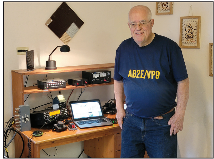
Darrell, AB2E/VP9, Top Low Power Single Operator Tribander – Wires Overlay Score in North America